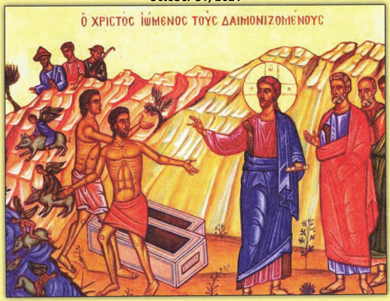
Icon of the Healing of the Gerasenes (Luke 8:26-39)