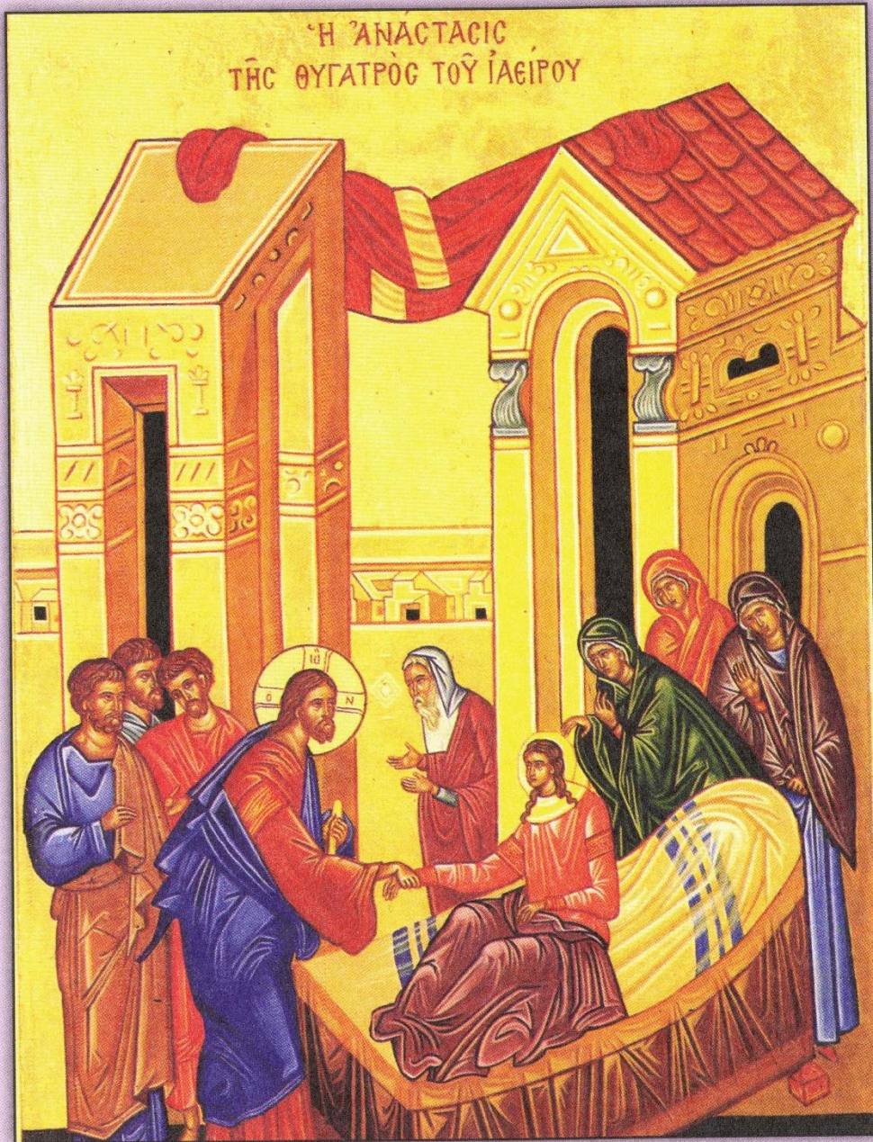
Icon of the Healing of Jairus' Daughter (Luke 8:41-56)