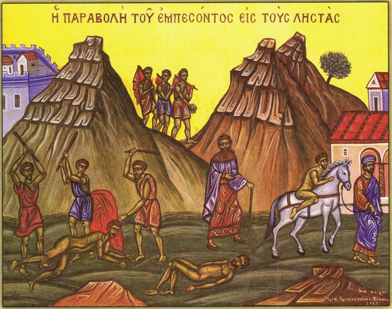
Icon of the Parable of the Good Samaritan (Luke 10:25-37)