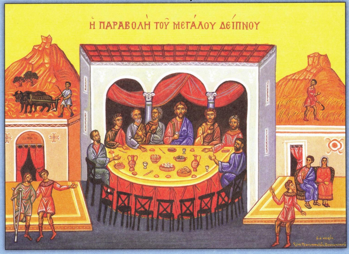
Icon of the Parable of the Great Feast