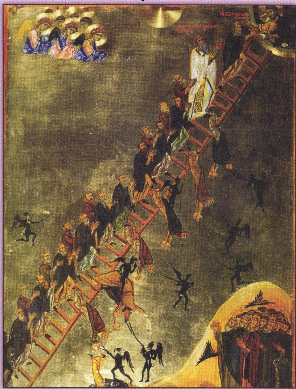
Icon of the Ladder of Divine Ascent