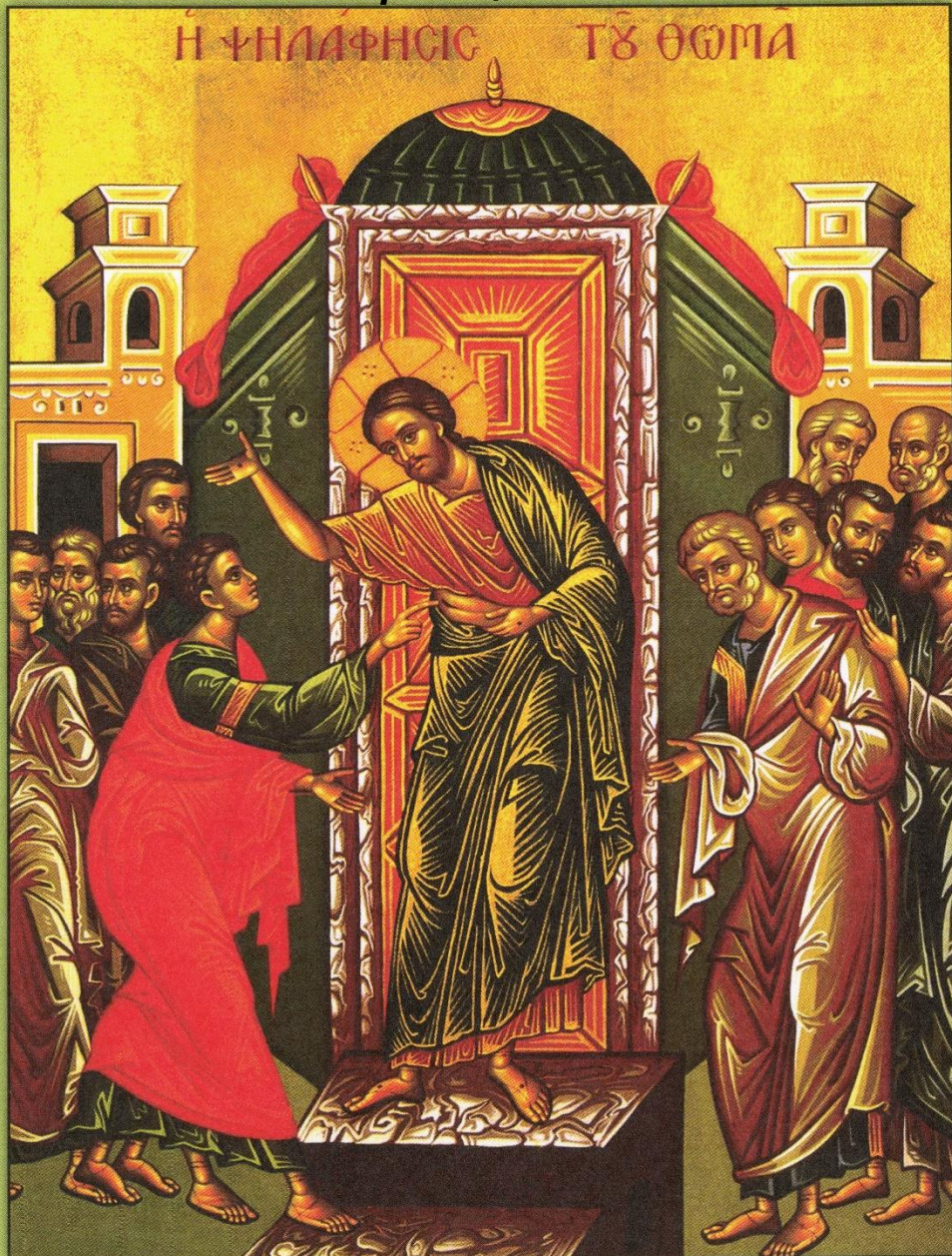
Icon of Christ and Saint Thomas