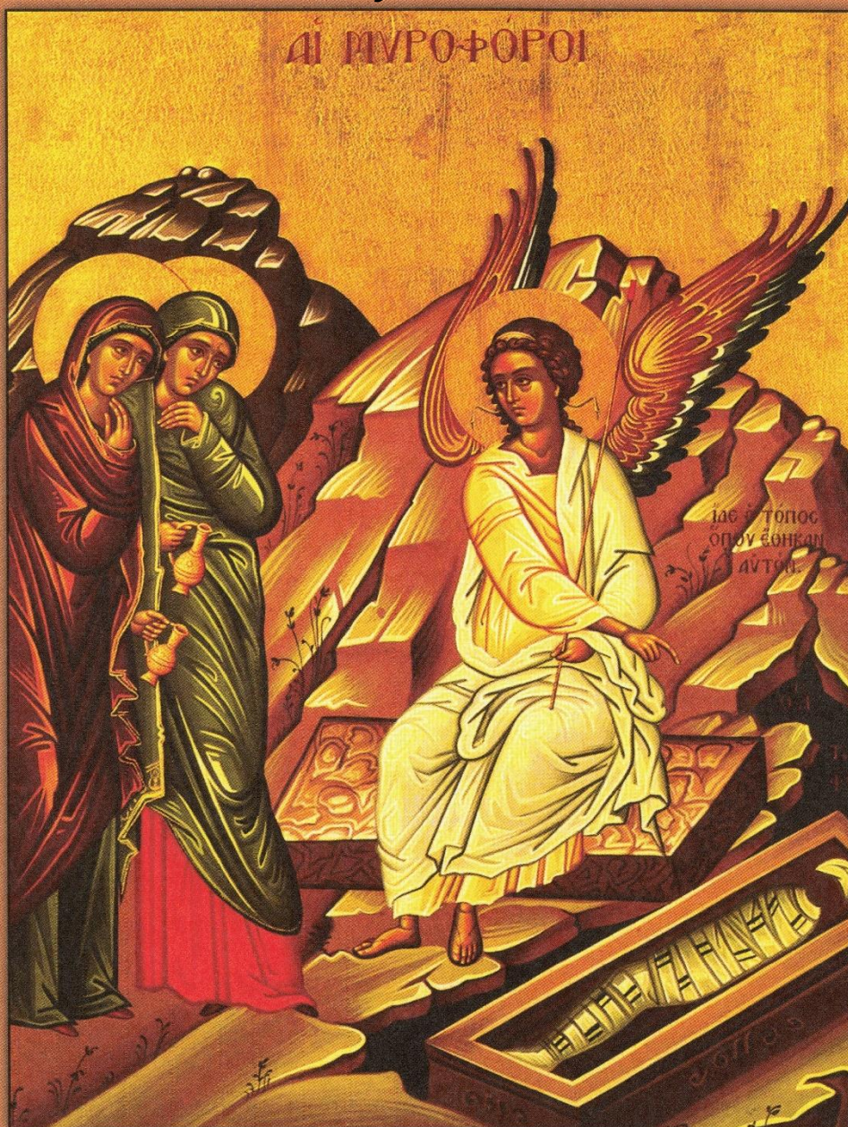
Icon of the Myrrh-bearing Women