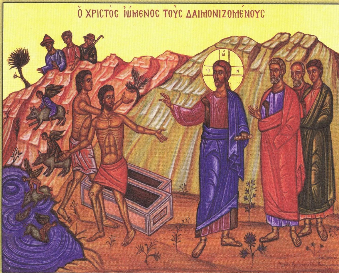
Icon of Christ Casting Out the Gadarene Demons