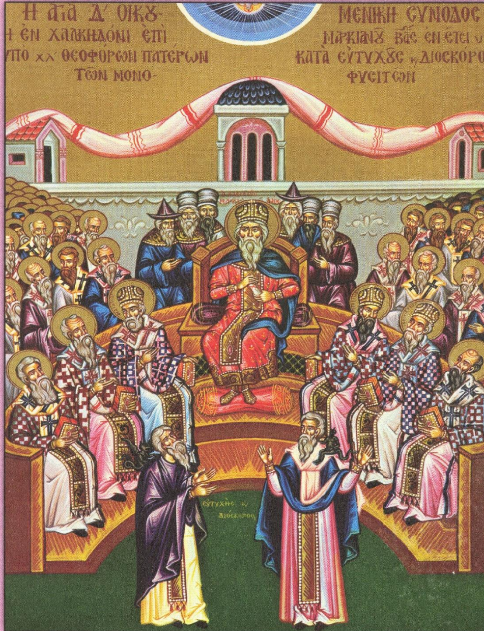
Icon of the Fathers of the First Six Ecumenical Councils

Those who believe in one God the Father Almighty ought to believe in His only-begotten Son. Jesus says: "I am the door. No one can come to the Father but by me" (Jn 10: 9; 14: 6).