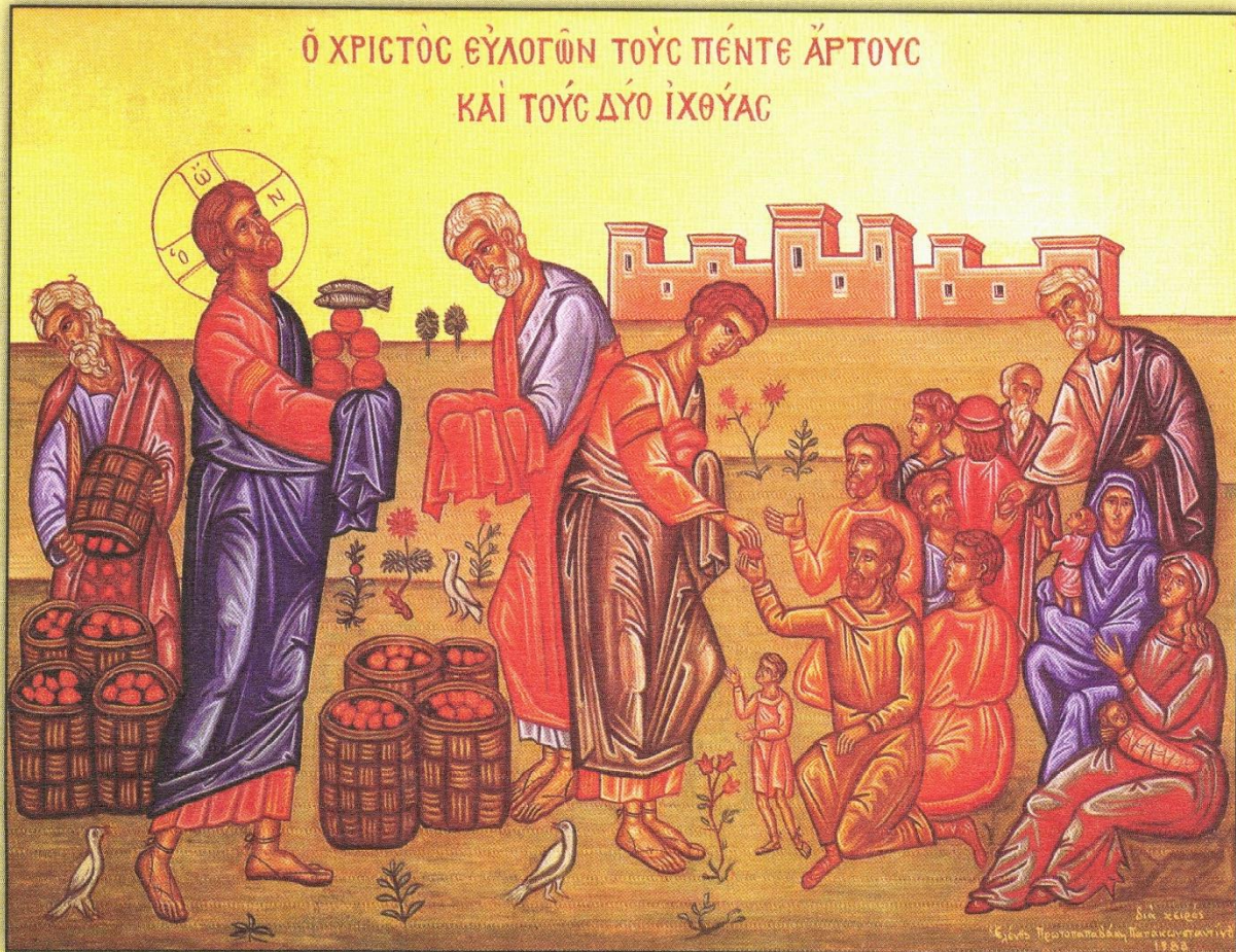
Icon of Feeding the Five Thousand

Our Lord in a desert place changed a few loaves into many, and at Cana turned water into wine. Thus before the time came to give men and women His own Body and Blood to feed on, He accustomed their palates to His bread and wine, giving them a taste of transitory bread and wine to teach them to delight in His Life-giving Body and Blood.