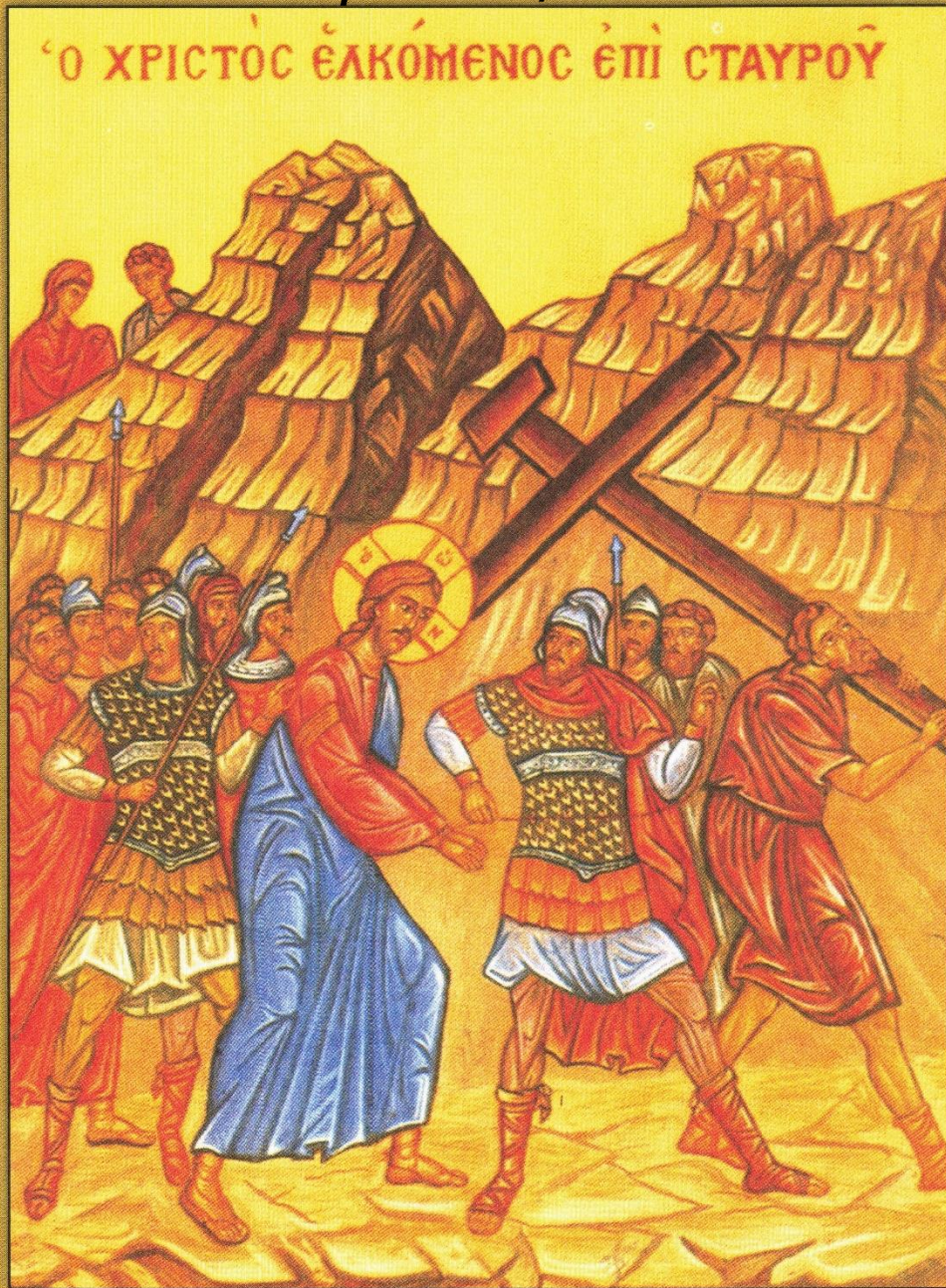
Icon of Simon Carrying the Cross of Christ

Turn, rather, to these teachings, my very dear friend: take up your cross and follow the Lord. For, when I noticed that you were being slowed down in your divine purpose by your preoccupation with domestic cares, I felt that you were being carried and dragged along by your cross rather than that you were carrying it.