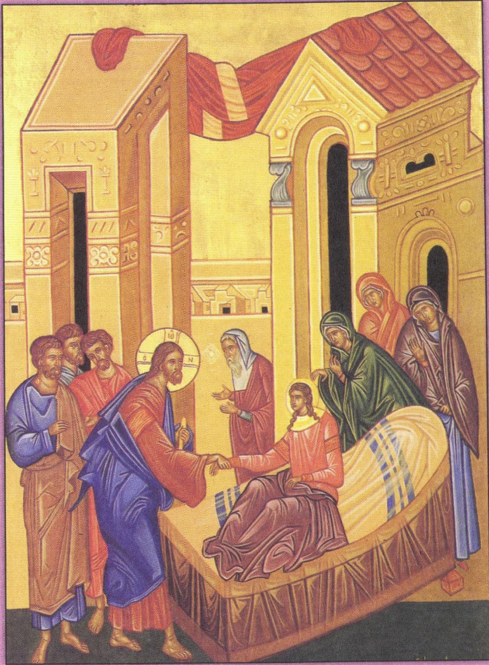
Icon of Raising the Daughter of Jairus

When the woman with a hemorrhage learned that the Lord said to the leader of the synagogue, "Believe, and your daughter will live," she thought to herself that he who could bring back the soul of a little girl of twelve into her body would also be able to take away an illness of twelve years and expel it from the body. When she heard him say, "Believe firmly and your daughter will live," this woman reflected, "I can give the faith he requires as the price." The healing came forth from his mouth, and he negotiated as its price the faith expressed by the woman's mouth. He gave clear healing and demanded a clear price. The healing that came out from his lips could be heard publicly, and he required from the lips a faith openly professed. Although the woman professed before