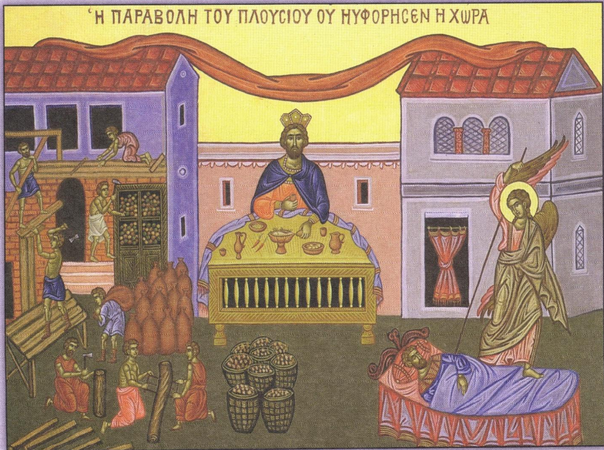
Icon of the Rich Fool (Luke 12:16-21)