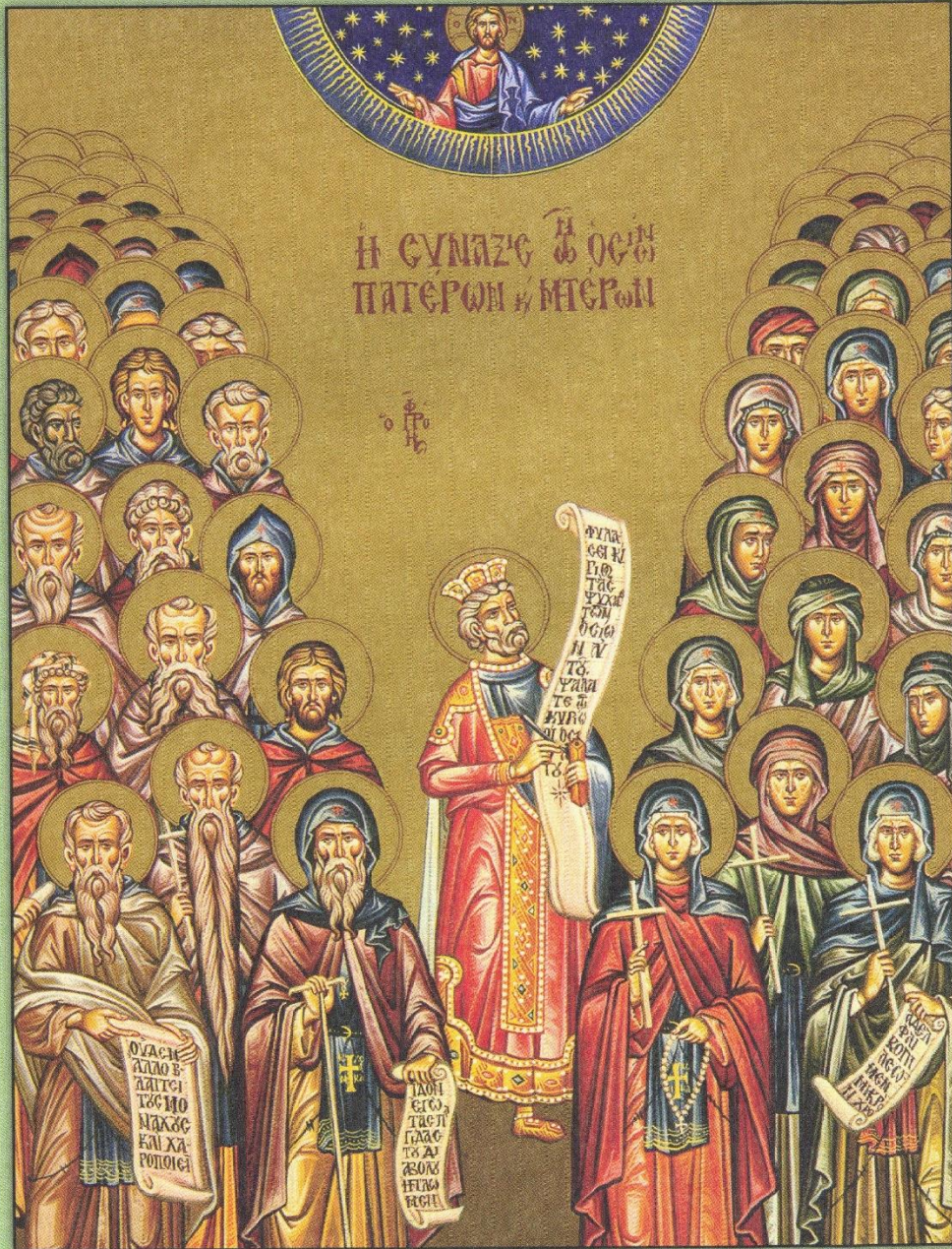
Icon of the Holy Ancestors

Matthew's genealogy is extraordinarily comprehensive in his theology of the roots of Jesus' story in the Old Testament. But that is only one part of the story of Jesus Christ. The story has a sequence as well; and the continuing sequence is what makes the genealogy "good news" for Matthew's audience and for us. Human being have been empowered to preserve, proclaim, and convey the salvation brought by Jesus Christ throughout history. The God who wrote the beginnings with crooked lines also writes the sequence with crooked lines, and some of those lines are our own lives and witness.