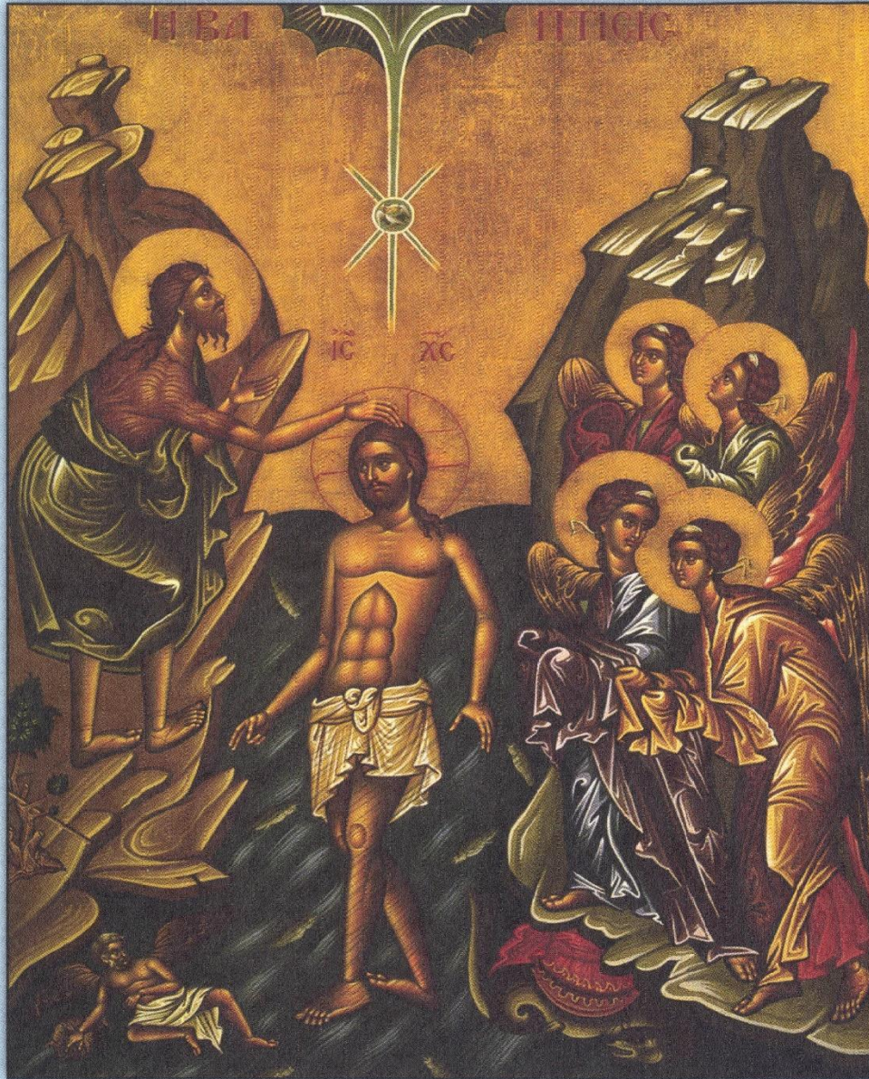
Icon of Theophany -- January 6th