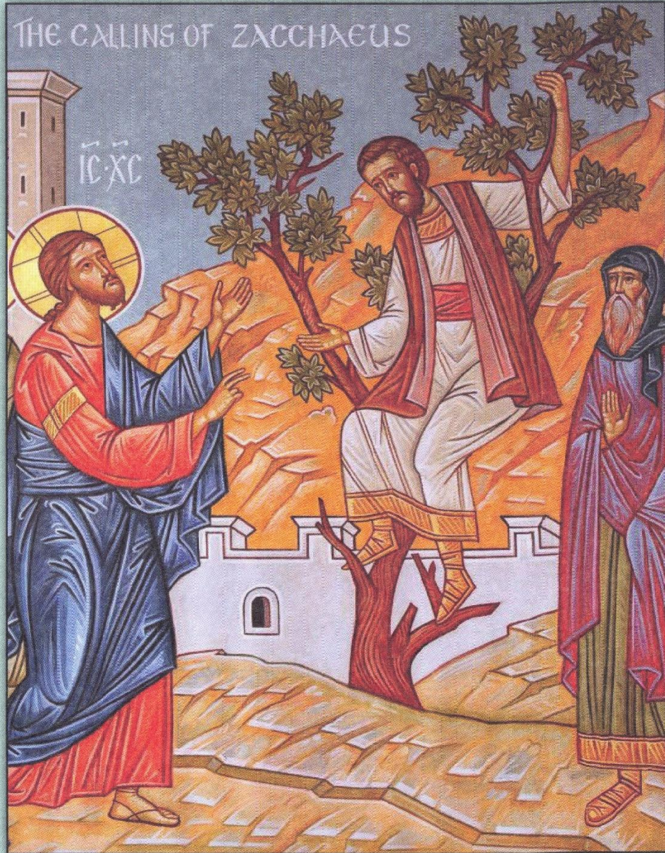
Icon of Christ and Zacchaeus (Luke 19:1-10)