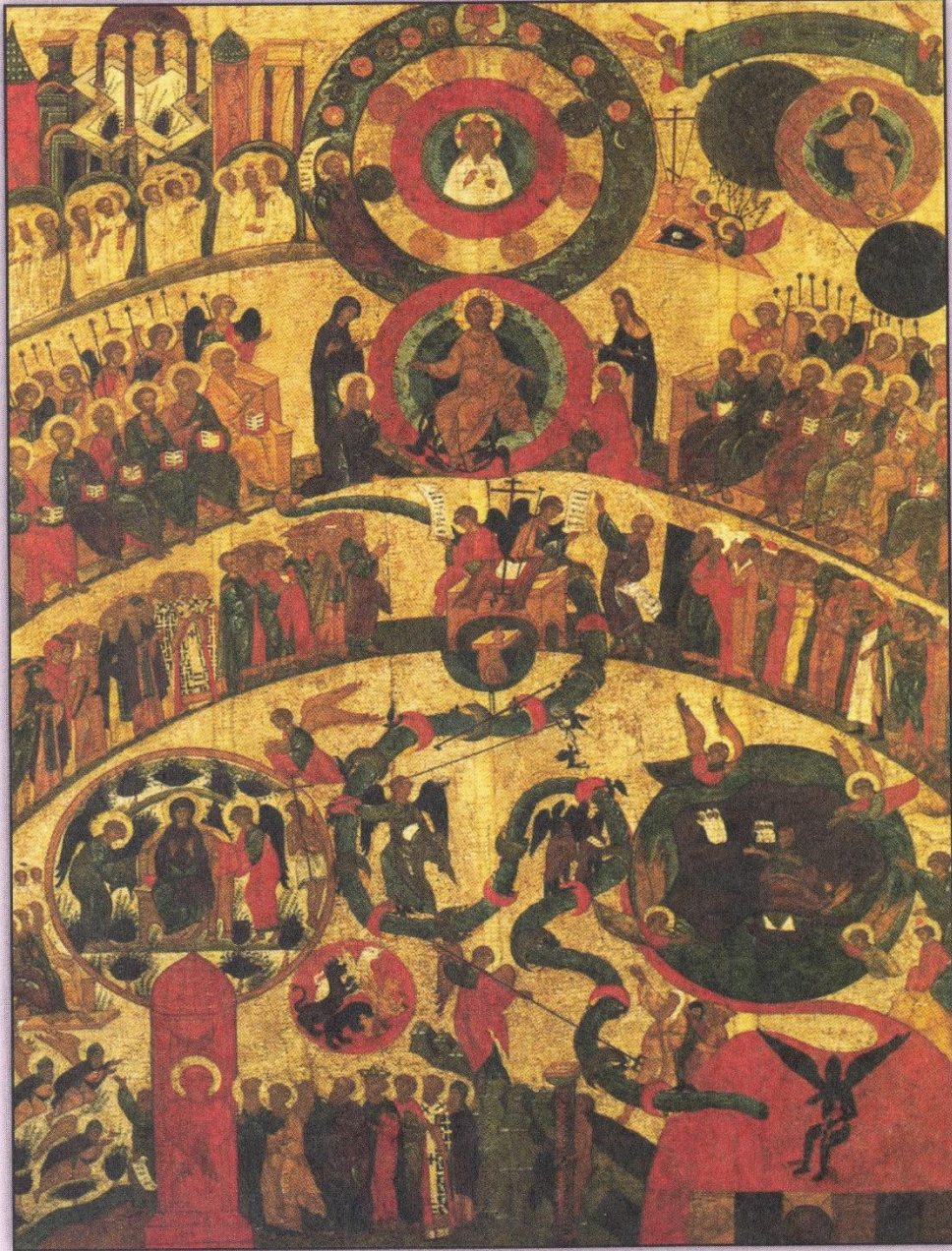
Icon of the Last Judgment

You see, my beloved, there is no excuse for it. They knew what they had to do in this world. But greed and ill-will prevented them, so they laid up for themselves not treasures for the future but the world of the dead. Neither were they condemned because of the active wrong they did, nor did the Lord say to them: depart from me, you wicked, because you committed murder or adultery or theft. But instead: because I was hungry and thirsty in my servants, and you did not minister to me. If those who did no wrong are thus condemned, what must be said of those who do the works of the devil? Will not the prophecy of blessed David come upon them: "The wicked will not stand in the judgment, nor sinners in the congregation of the righteous?" Not that they will not rise, but that neither in judgment [nor in] the congregation of the righteous do they deserve to enter. They will stand, however, so that from