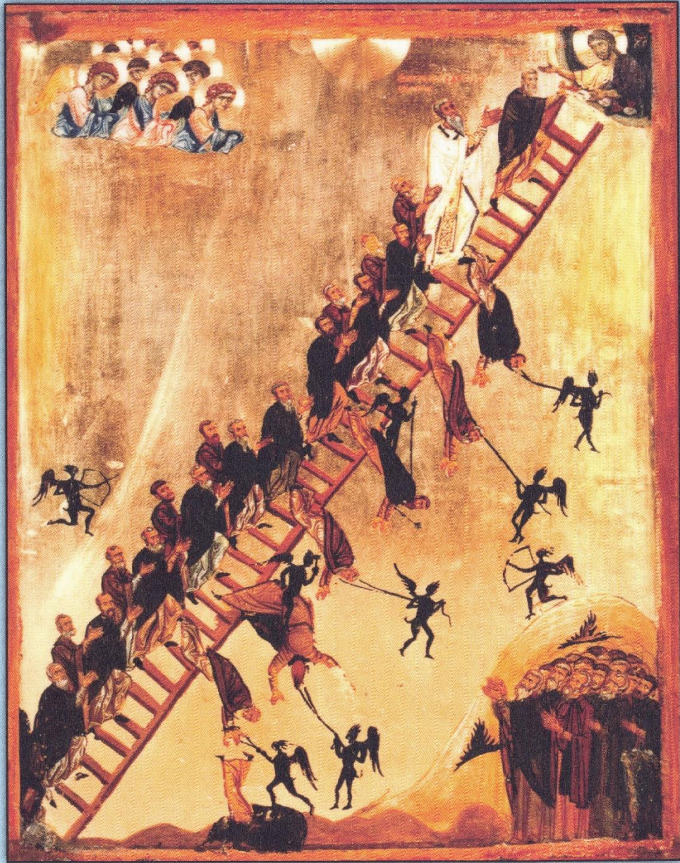
Icon of the the Ladder of Divine Ascent

Nothing makes us so like God as our readiness to forgive the wicked and wrongdoer. For it is God who has made “the sun to shine on the evil and on the good.”