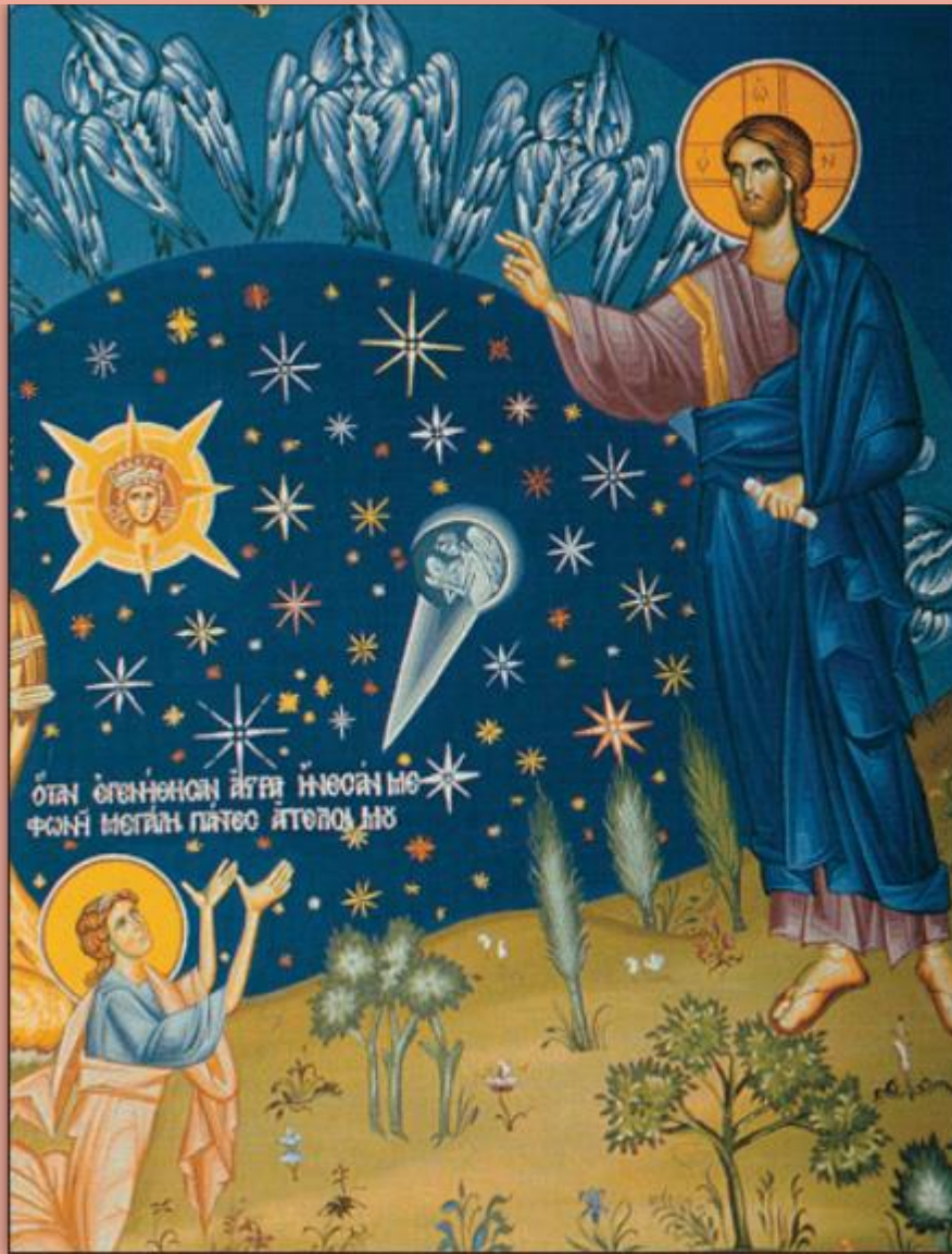
Icon of Creation