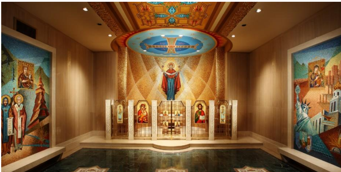
Byzantine Ruthenian Chapel in the Basilica of the National Shrine of the Immaculate Conception; Washington, DC

Here is the link to more information on this celebratory weekend: parma.org/events/100th-anniversary-celebration & Here is the link to register: Centenary of the Byzantine Catholic Church (byzantine100.com)